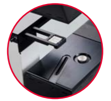
automatic, three-stage reference unit with interchangeable standard gauge blocks