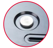
tooling-free maintenance accesses