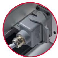
robust and durable design