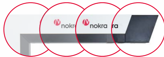
product versions C-frame measuring depths 500 / 1000 / 1500 / 2100 mm

laser based strip thickness measurement offering a measurement depth of up to 2100 mm