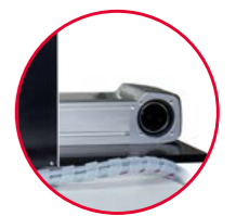
scalable linear guide with servo drive for precise traversing operation